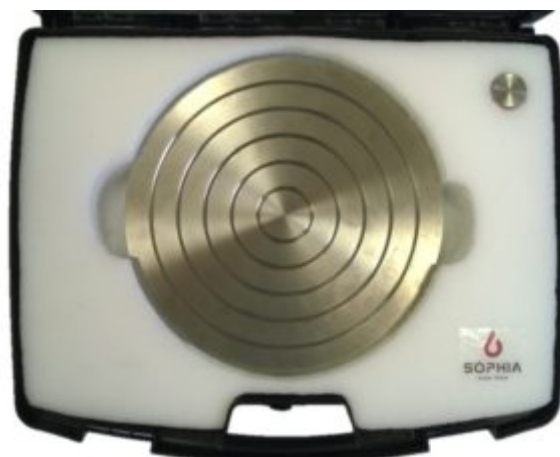
COMPRESSION PLATENS - FIXED AND SPHERICAL SEAT TESTING FIXTURE - packaging